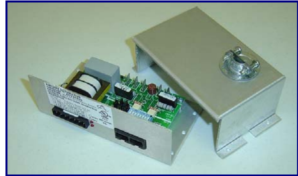
Pictured- 1041U-001 with optional Cover